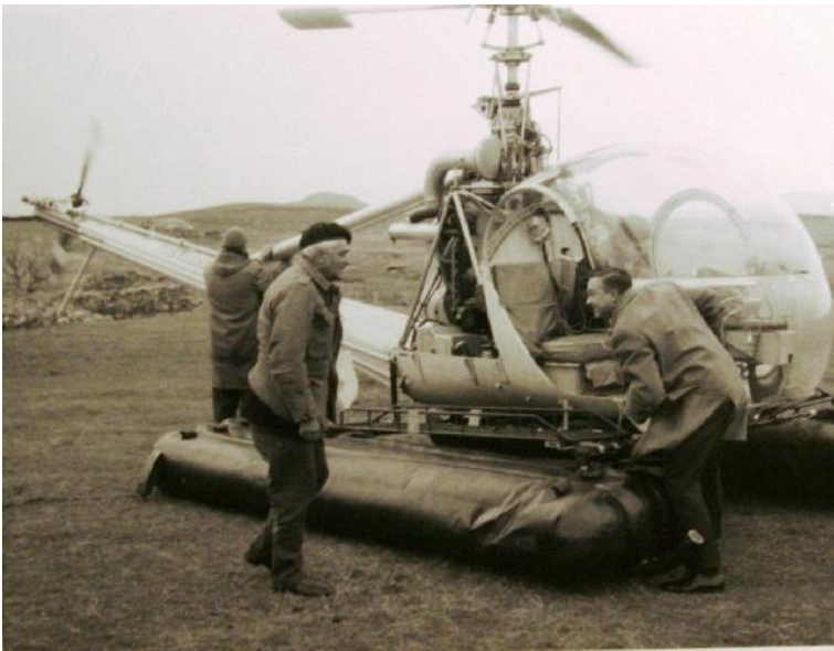
Figure 4. Surveyors preparing the helicopter for a tidal line survey experiment in 1968 (TNA PRO OS 13/19)

As well as the aerial photogrammetric tests using conventional aeroplanes, further experiments were performed during 1967/8 using helicopter photography to map tidal lines between Loch Sunart and the Isle of Mull. 34 The principal aim of the experiment was to discover if suitable photographs could be obtained using helicopters ( Figure 4 ). The results concluded that the quality of the photography varied depending upon the stability of the helicopter and the results of the experiment were mixed, partly due to the poor weather