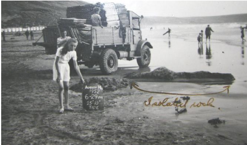
Figure 2. A volunteer holds a chalkboard displaying the tide and time during a tidal survey in 1952 (TNA PRO OS/561)

‘Admiralty policy of adopting independent chart datum’ and because ‘The Low Water mark now being adopted on Admiralty charts is that of lowest astronomical tide (LAT). This low water line is clearly contrary to that defined by the Lord Chancellor in 1854’. 14 Before the advent and adoption of suitable photogrammetric techniques, the main method for capturing tidal line data was by using field survey ( figure 2 ). The instructions given to Ordnance Survey